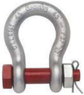
G-2130 / S-2130

G-2130 Bolt Type Anchor shackles with thin head bolt - nut with cotter pin. Meets the performance requirements of Federal Specification RR-C-271F Type IVA, Grade A, Class 3, except for those provisions required of the contractor. For additional information, see page 444.